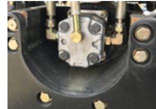
Fully Hydraulic (Both Drive and Vibration) suitable for tough and hot condition, reduces maintenance cost.